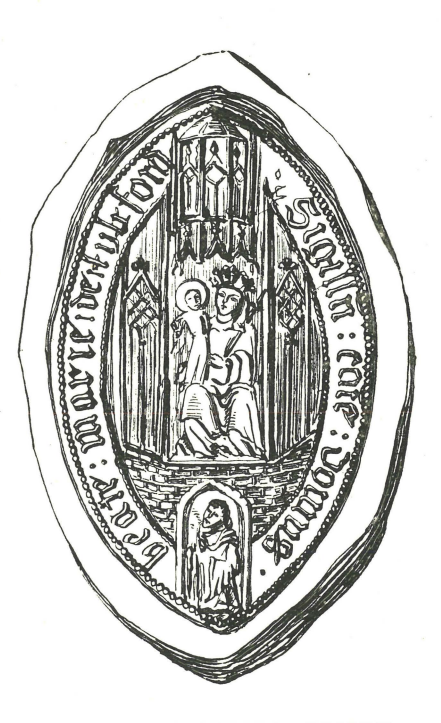
SEAL OF TICKFORD PRIORY.

From sketch of impression at the British Museum.