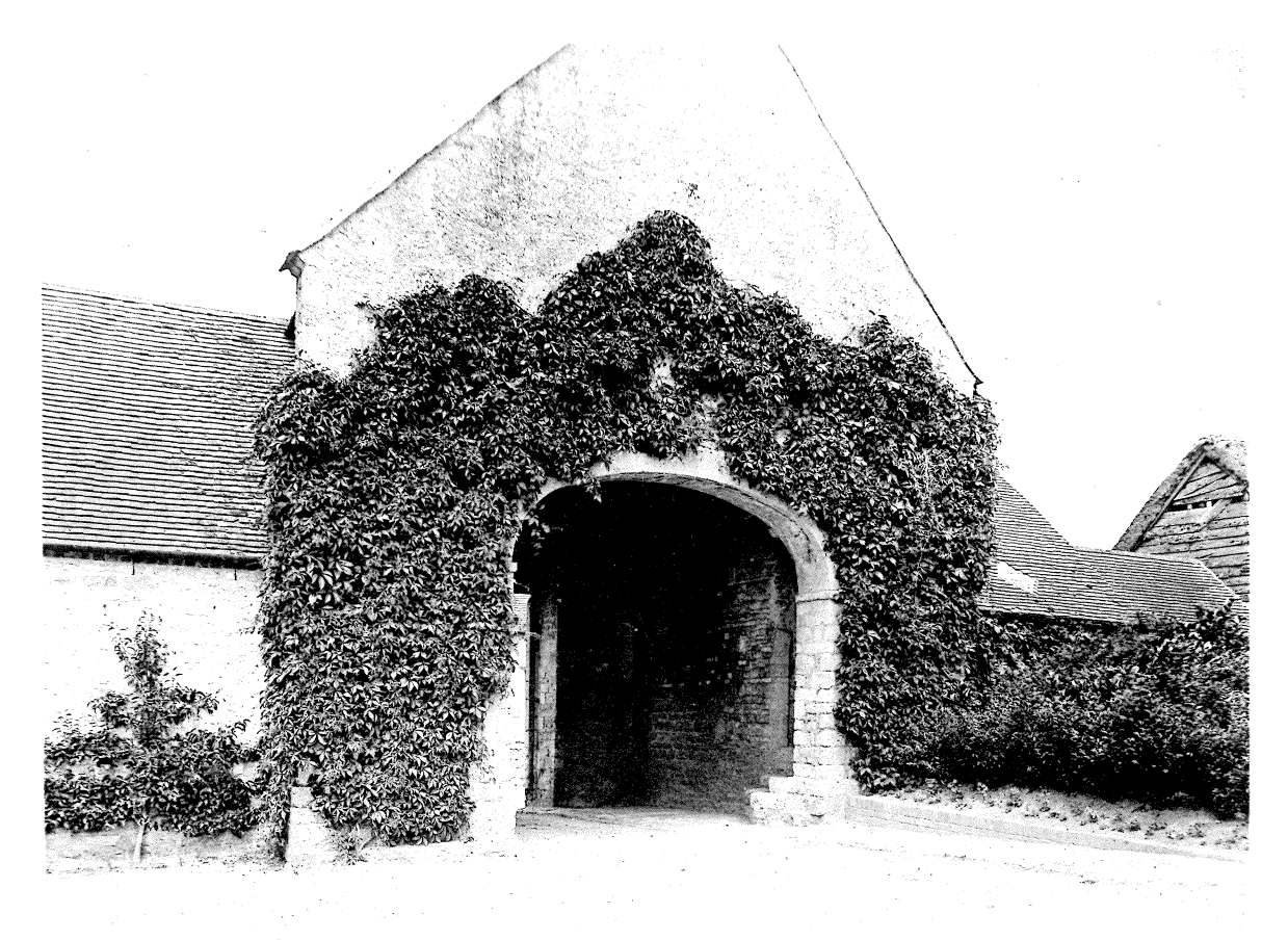
GATEWAY, LONG CRENDON MANOR—VIEW FROM COURT YARD.