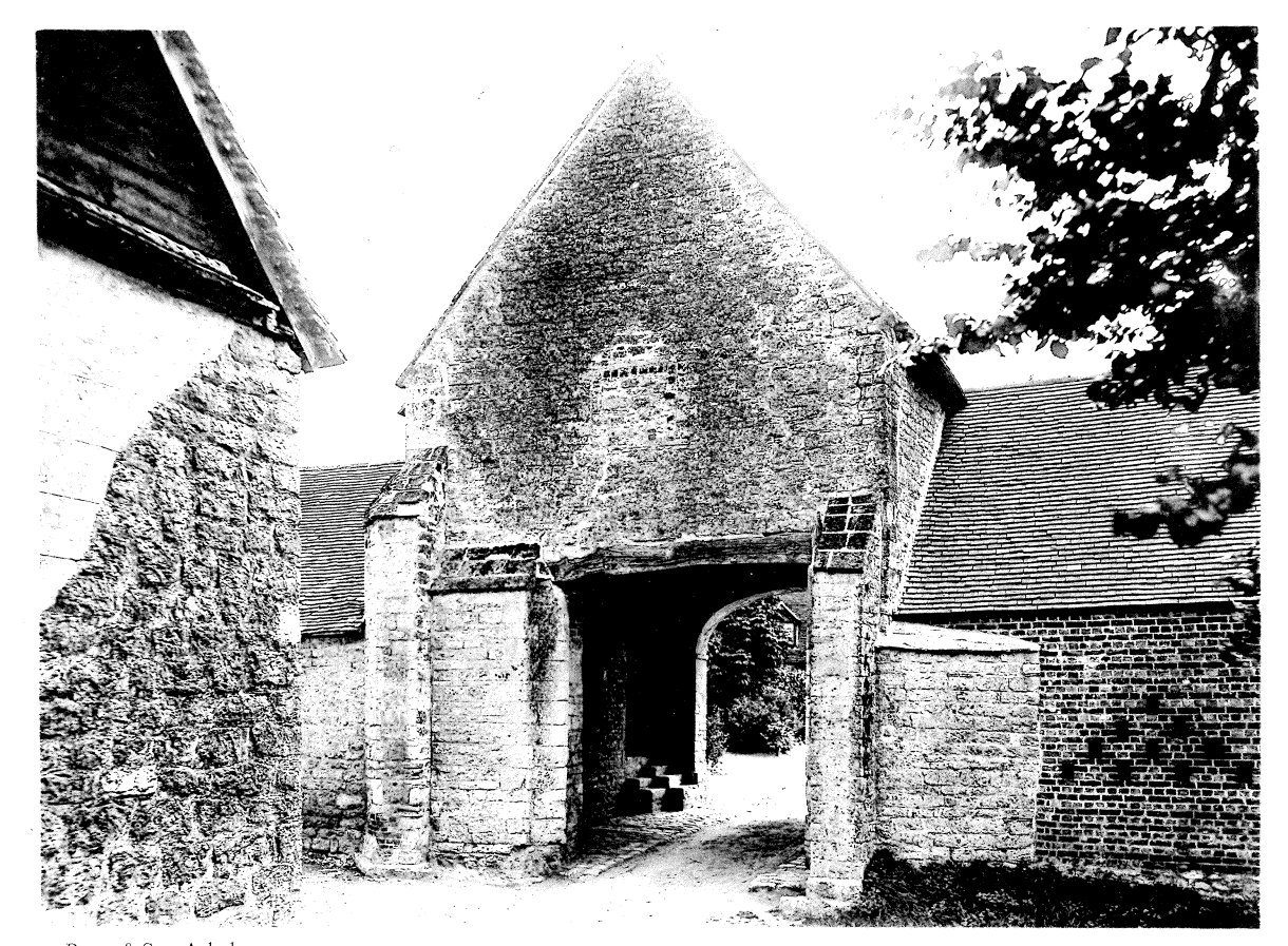
C. AY, LONG CRENDON MANOR—FRONT VIEW.