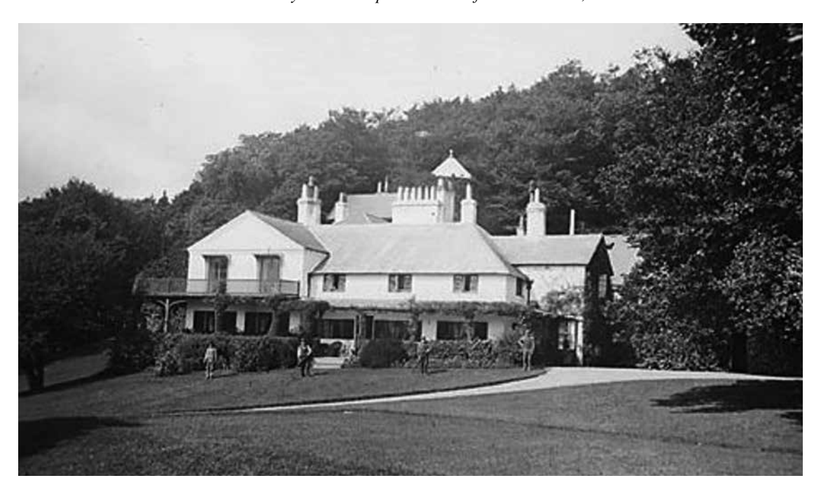
FIGURE 3 Craig-y-don, Anglesey, c.1890