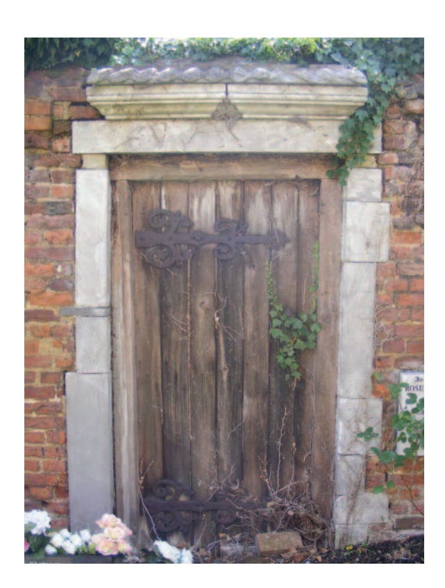
FIGURE 1 Doorway in the churchyard wall at St Michael's church, Horton, general view

further marble elements, although small fragments of moulded Portland stone were found lying loose within the churchyard. The identical white marble elements above the lintel are moulded plinths or bases of pedestals of the Corinthian order, with the modification of an added torus, approximately 0.605m wide, 0.14m high and at least 0.14m deep.<sup>2</sup> Based on contemporary principles of architecture the pedestals they supported would have been approximately 3ft 3in (98.1cm) high. The black marble gadrooned element is 1.2m long and at least 0.23m deep – the gadrooning wraps around the sides of the block – and has upper and lower mouldings (Fig. 2).