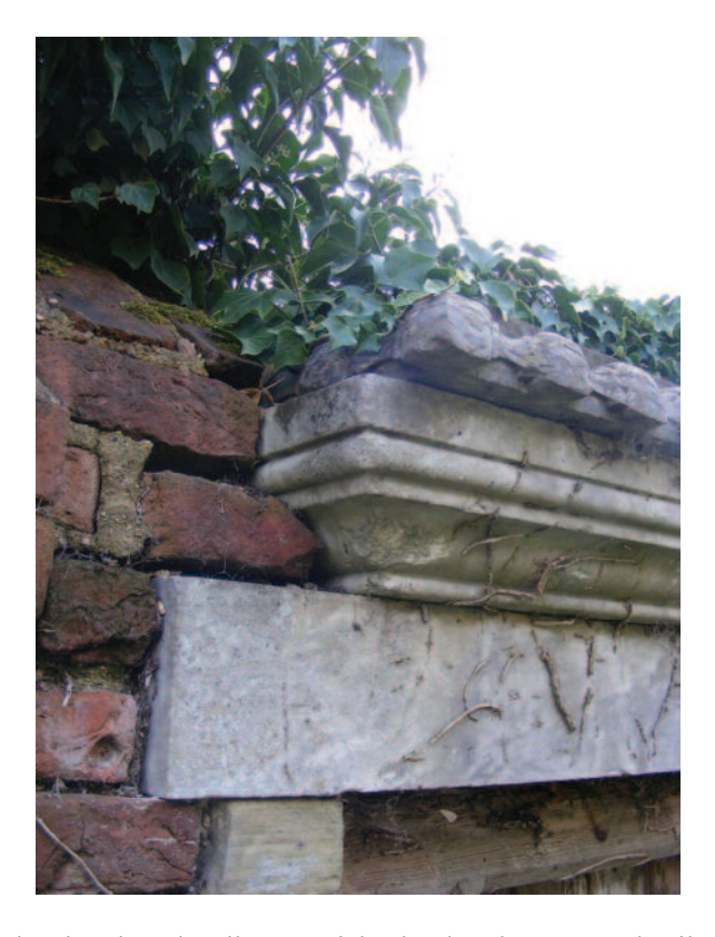
FIGURE 2 Doorway in the churchyard wall at St Michael's church, Horton, detailed view

The only substantial monument recorded within the church, which these elements are likely to have been part of, was positioned against the north wall of the North Chapel between two blocked windows, as indicated on the architect John Oldrid Scott's plan of the church prior to his restoration in 1876 (Fig. 3).<sup>3</sup> In this position it could be seen from the main body of the church across a large pew. During the restoration the monument was dismantled, the blocked windows reopened, and the slightly pointed plate glass-filled chapel east window replaced with gothic tracery.<sup>4</sup> Scott's plan for the restored church, dated 22nd March 1876,<sup>5</sup> indicates that the monument was to be repositioned under the tower against the south wall - a classic Victorian solution for unwanted but almost grudgingly retained monuments - although it is obvious this intention was not carried out.