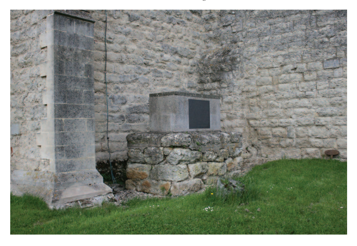
FIGURE 2 The tomb in Hardwick Churchyard

states categorically that there were thirty-eight , all adults, and all below middle age, with few exceptions. It comments on the differing preservation between those found in clay and those buried in gravel, and on the lack of associated artefacts. There is some speculation regarding the origin of the burials, and although the unnamed author (an "old correspondent") suggests that these could be Saxon burials, he comes down in favour of their being of Civil War date, primarily because of their state of preservation. The "Battle of Aylesbury" is not mentioned: indeed, the writer does not appear to have heard of it.