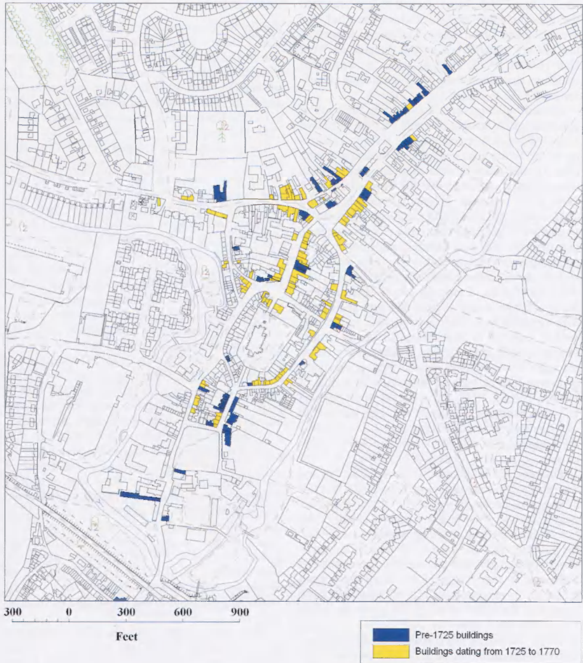
FIGURE 6 Extent of the 1725 fire on Ordnance Survey Map (2002).