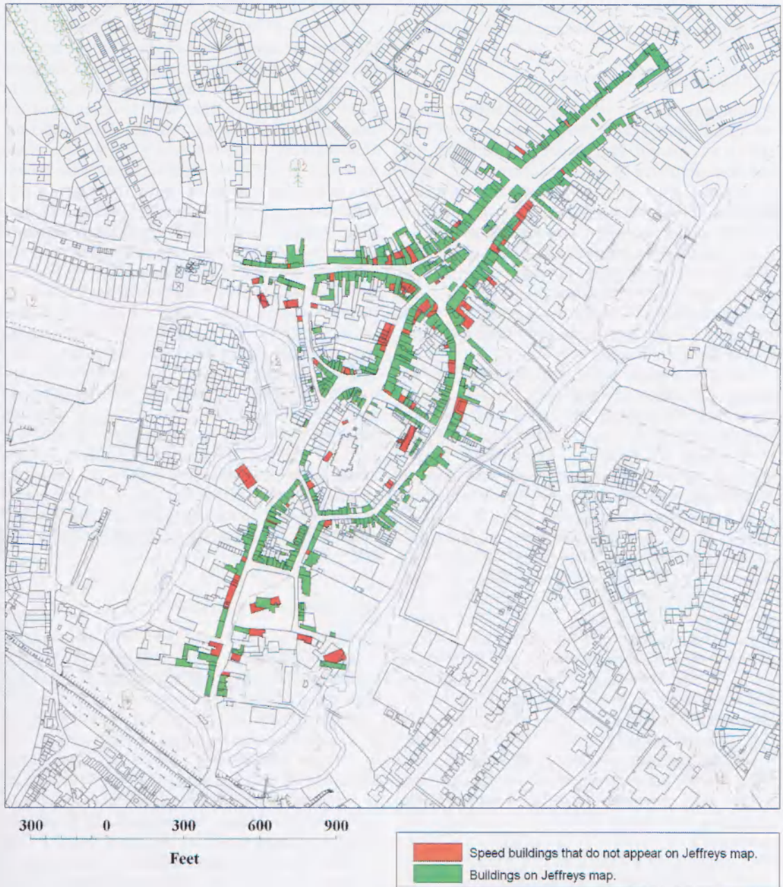
FIGURE 5 Speed's Map (1611) and Jeffreys Map (1770) overlaid on to the Ordnance Survey Map.