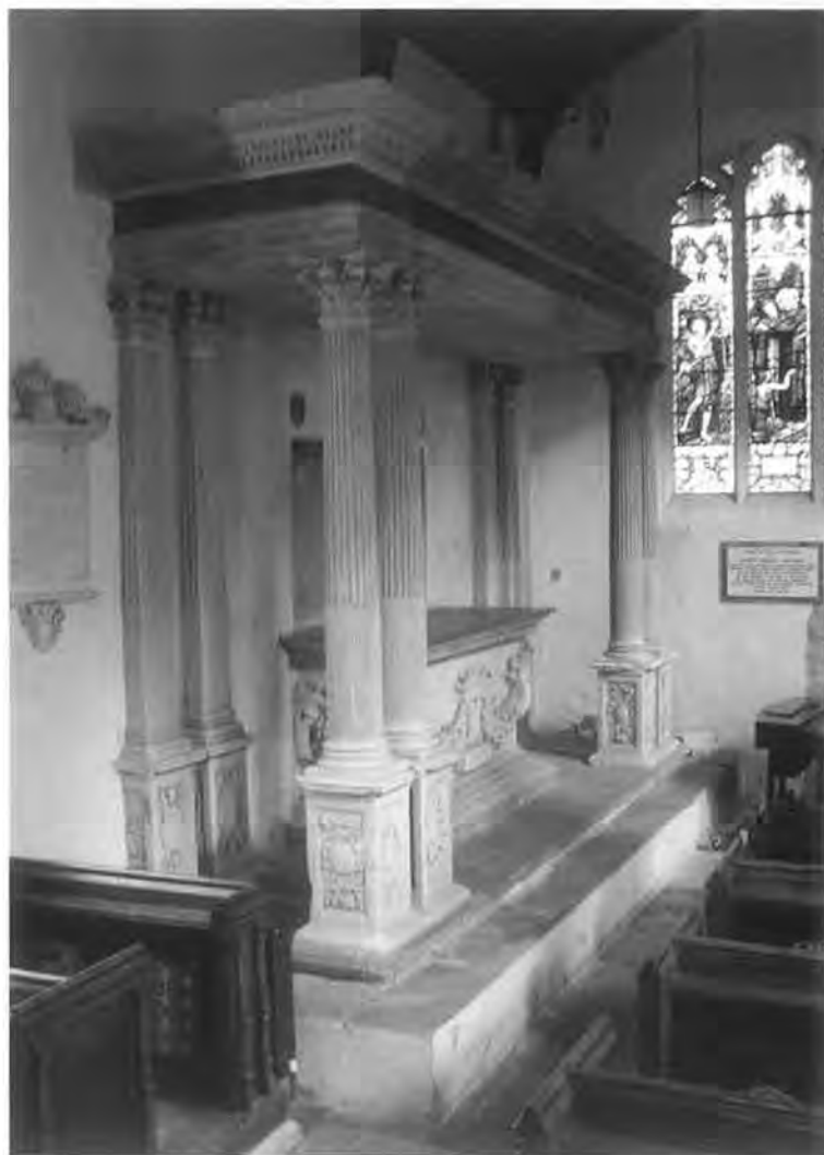
FIGURE 1 The Dormer tomb.

1552) which attracts attention by its pure Classical composition (Fig. 1 and 2), but it is also the one which poses most problems about its origins and date. Should one take at face value the date of 1552