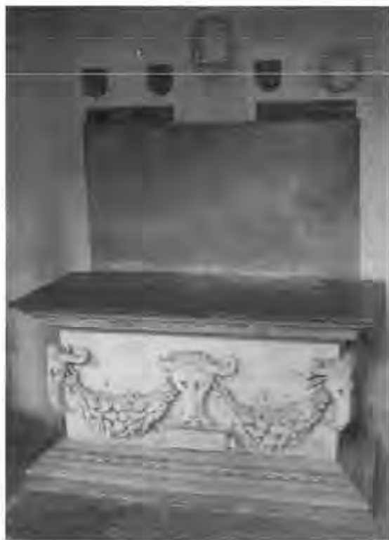
FIGURE 2 Detail of the Dormer tomb.

If one accepts the evidence that the tomb is a two-fold composition, the first being the tomb-chest with its lid, and the second being the back wall, the brasses and the canopy, then it is possible to argue that the tomb evolved over three decades. The first stage is the ordering of a tomb chest to Sir Robert. This is the classical chest with bucrania and the low relief date 1552 carved simultaneously with the sarcophagus. It stood on the aisle floor near the east wall but did not impinge upon the stone altar, newly restored (1554), in the chapel of St. Mary. The tomb's Purbeck marble lid probably