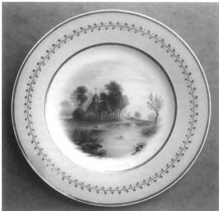
FIGURE 1 The Boveney Plate.