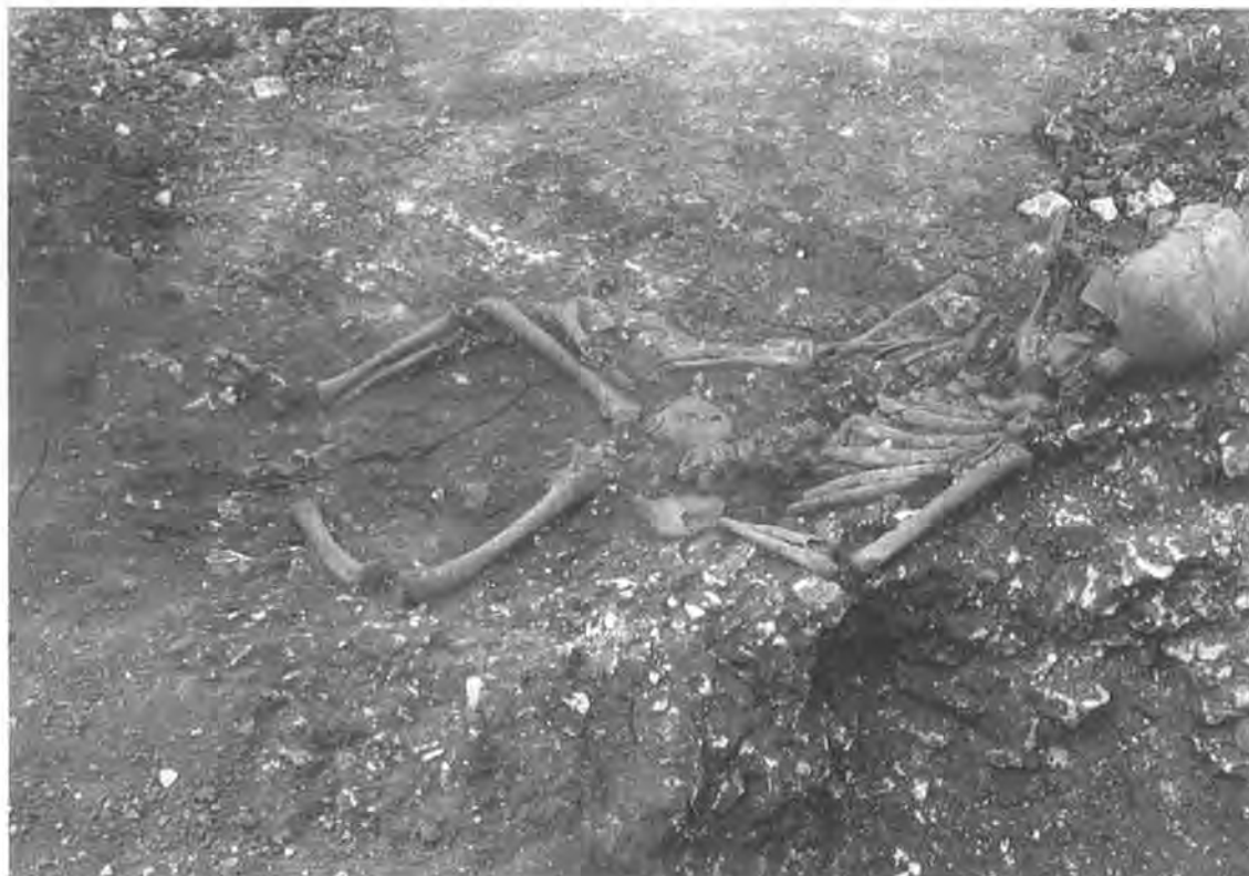
FIGURE 2 Burial (010) during excavation.

male, of which over 80% of the skeleton survives. Several fragments of neonatal bone were recovered from the skull area of the burial. These may represent the remains of an earlier burial that was disturbed by the insertion of the infant or, since several fragments of animal bone were also recovered from the context, the neonatal remains may already have been disarticulated. Bone from pit 005 includes parts of both the right and left lower limb of an unburnt neonatal skeleton, though neither side comprised a 'complete' set of relevant bones. The pit was only half-sectioned and it is possible that the rest of an articulated skeleton remains unexcavated. However, most of the bones are represented by fragments showing old breaks which may argue against that possibility and it is not clear whether this pit was actually dug as a grave or the bones were simply placed conveniently into it.