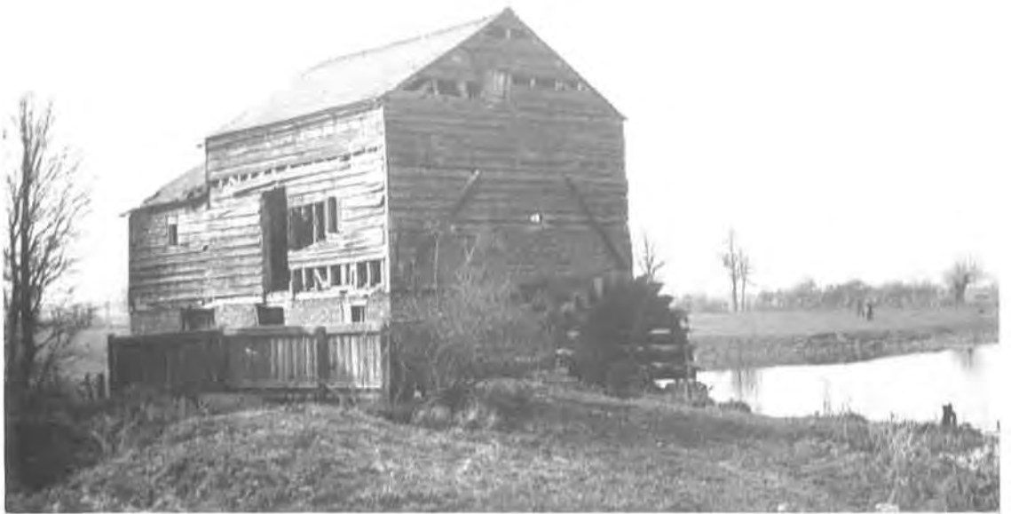
Plate I a Little Woolstone Mill 'North'. 1937 (S.H. Freese). Woolstone-cum-Willen A.