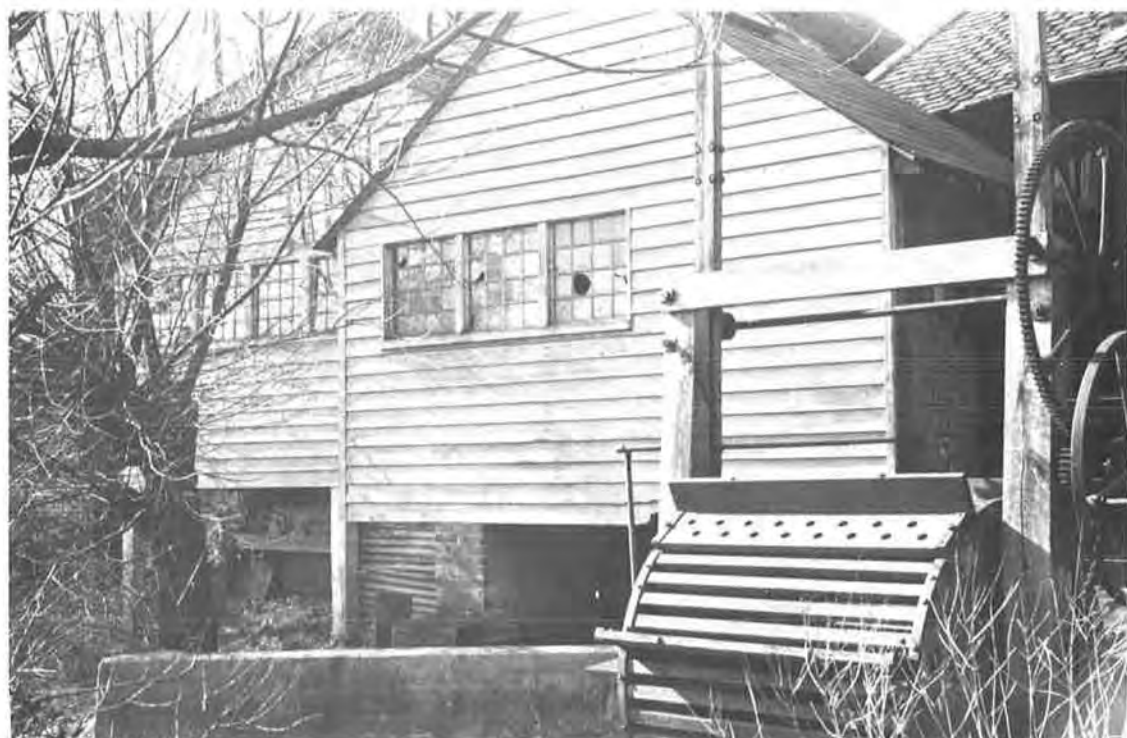
Plate II a Felt washer at Marlow paper mill. 1938 (S.H. Freese).