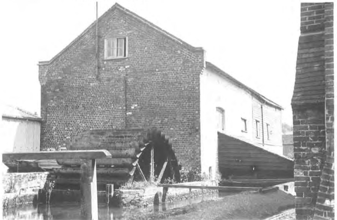
Plate I b Bowden Mill, High Wycombe. 1939 (S.H. Freese). High Wycombe K.