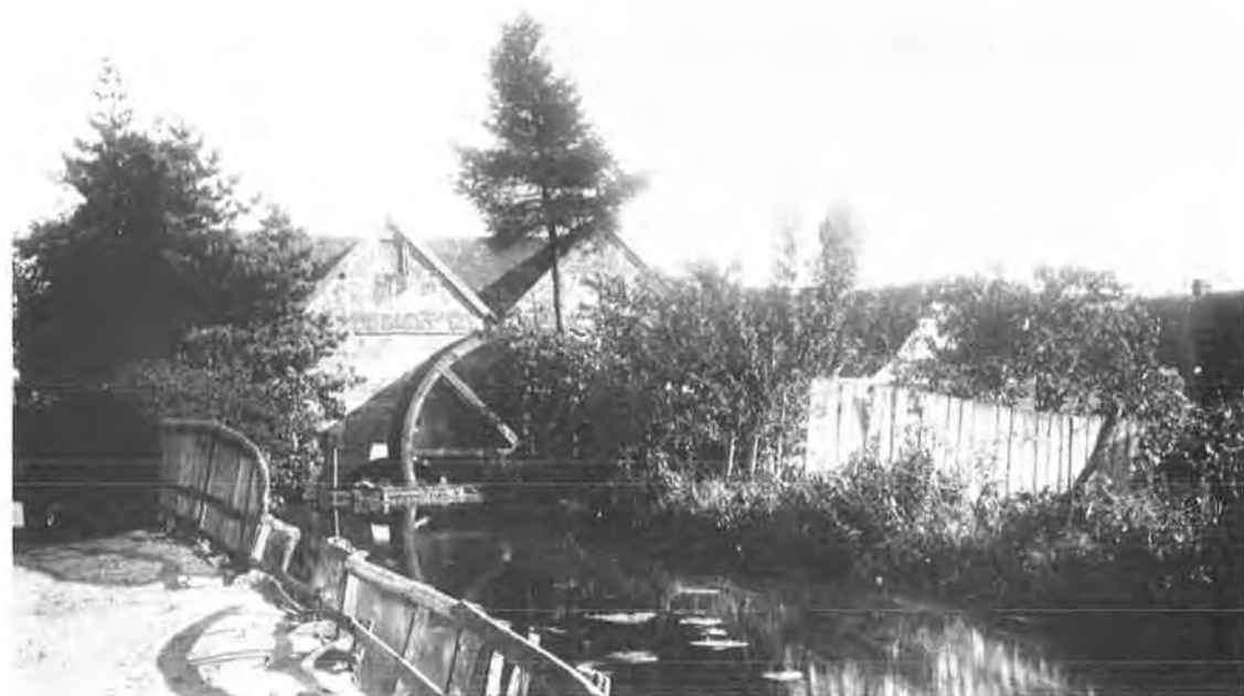
Plate II b Lord's Mill, Chesham. Pre 1920 Chesham C.