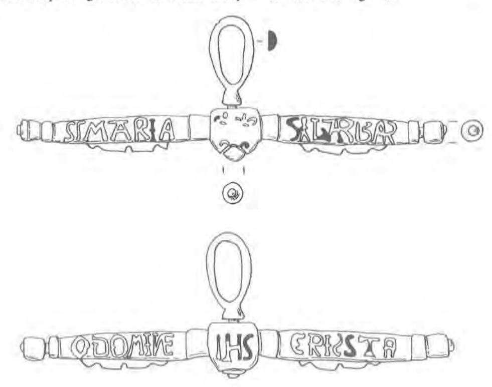
Fig. 1. Bronze purse-frame from Denham (2:3).

about the main bar. Both ends of the bar and the lower part of the loop terminal have separate 'beads'. Such objects are well-known in the late medieval period but the Denham find is particularly interesting, either face of the arms containing an inscription picked out in green enamel, traces of which survive in a number of the letters (indicated by cross-hatching in the illustration). The obverse reads O DOMINE CRISSTA, the N and E of the second word being ligatured; the first S of the last word is retrograde.