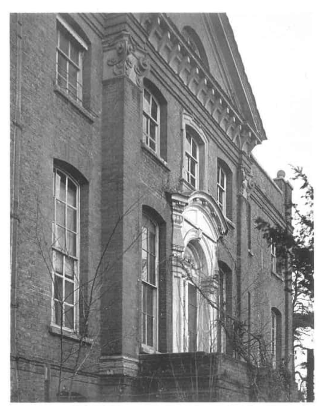
PLATE 7. MARLOW PLACE