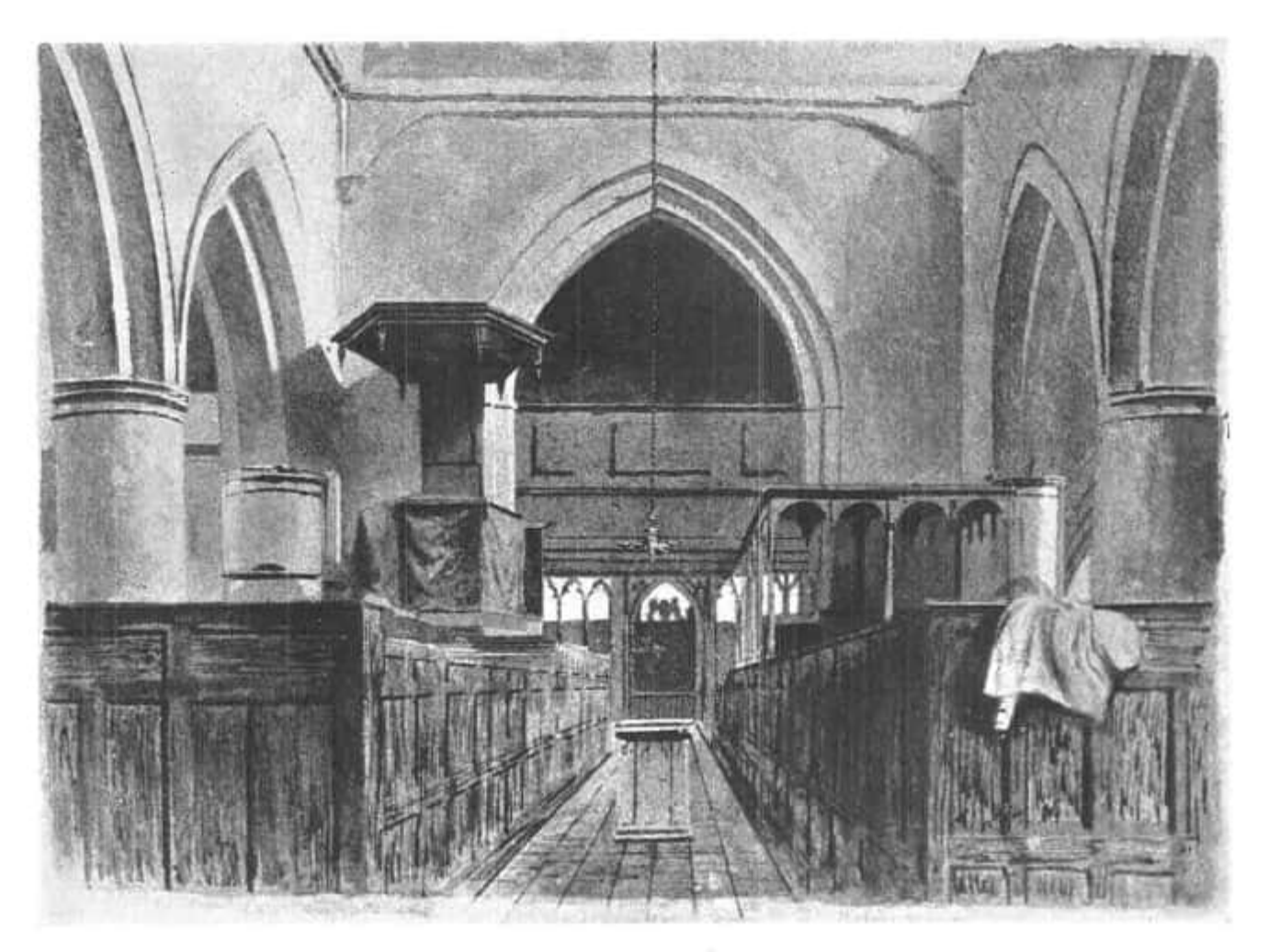
PLATE 3. MARLOW OLD CHURCH: THE INTERIOR