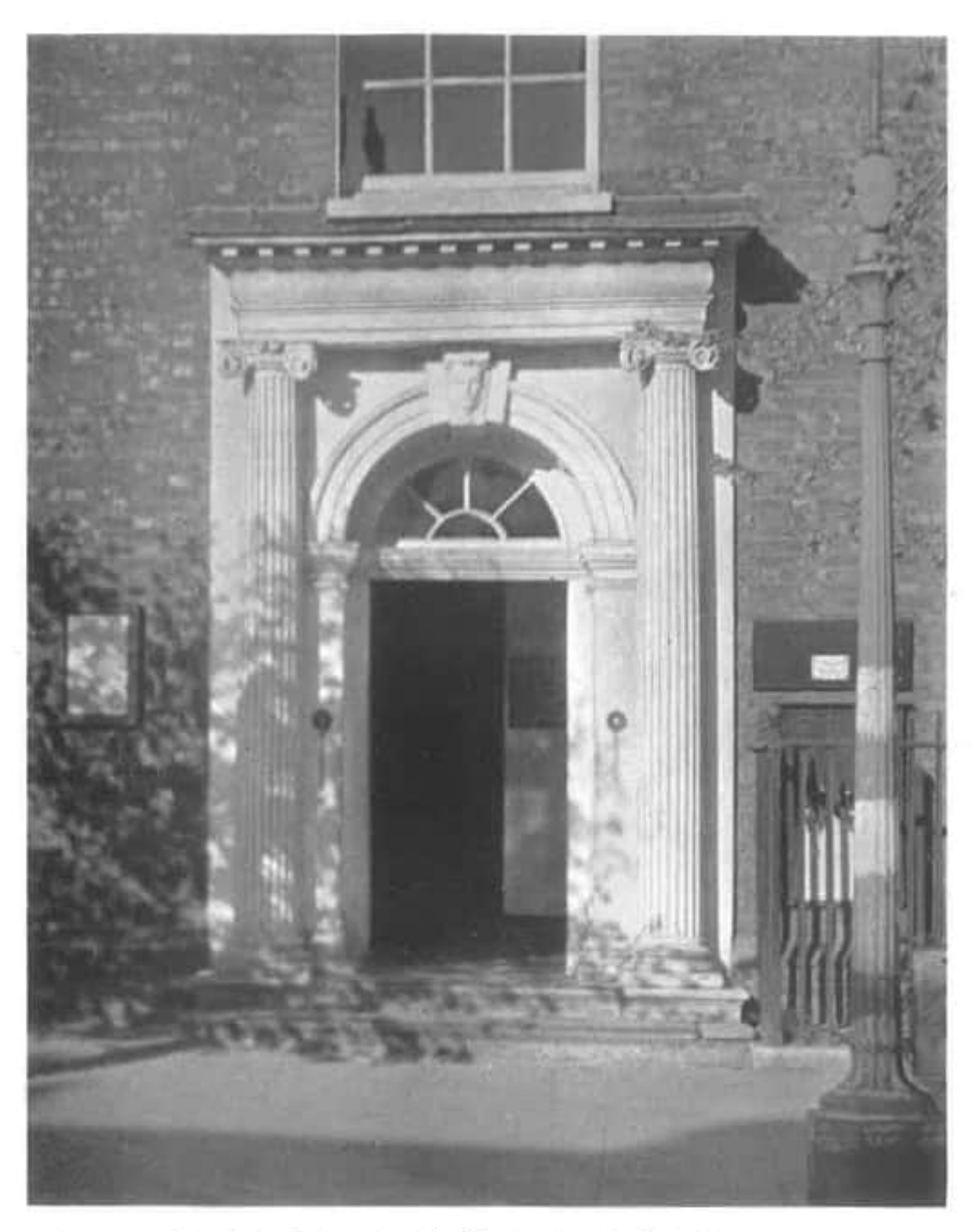
PLATE 2. MARLOW POST OFFICE: THE DOORWAY