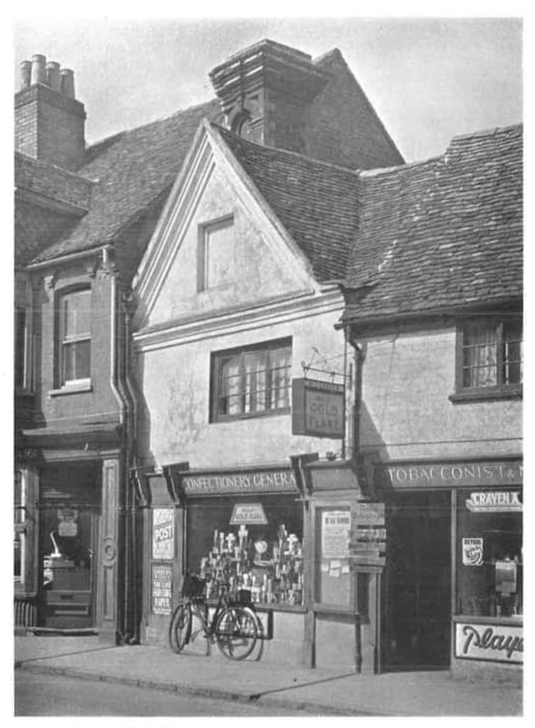
PLATE 6. 27 SPITTAL STREET, MARLOW