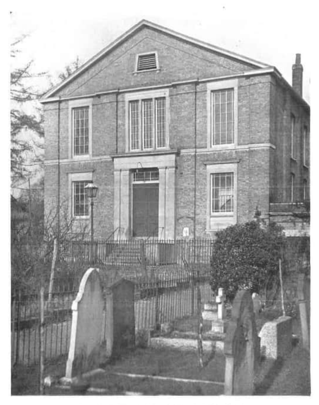
PLATE 8. THE CONGREGATIONAL CHAPEL, MARLOW