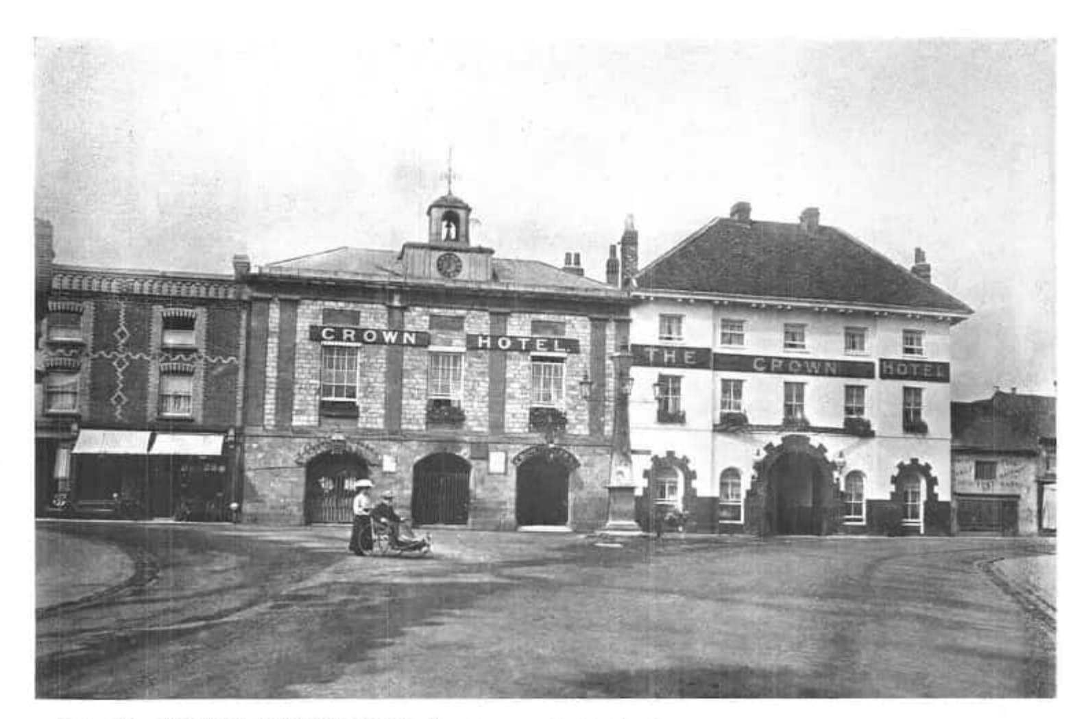
PLATE 10. MARLOW MARKET-PLACE (FROM AN OLD PHOTOGRAPH)