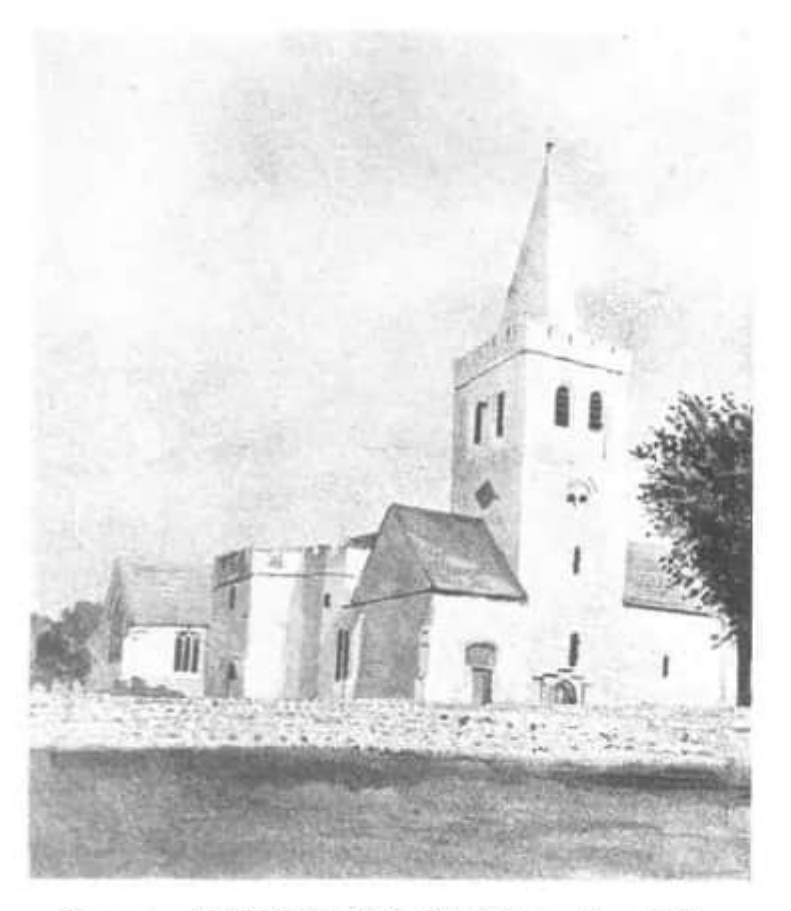
PLATE 4. MARLOW OLD CHURCH, circa 1825