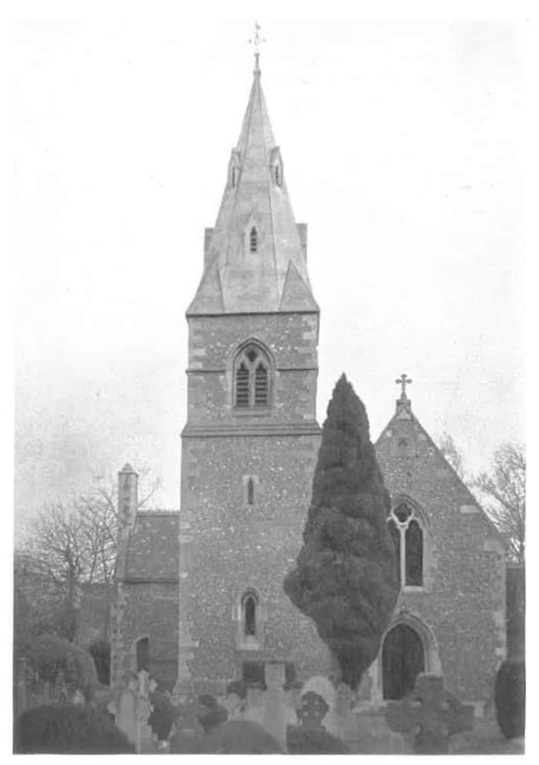
PLATE 9. MARLOW ROMAN CATHOLIC CHURCH