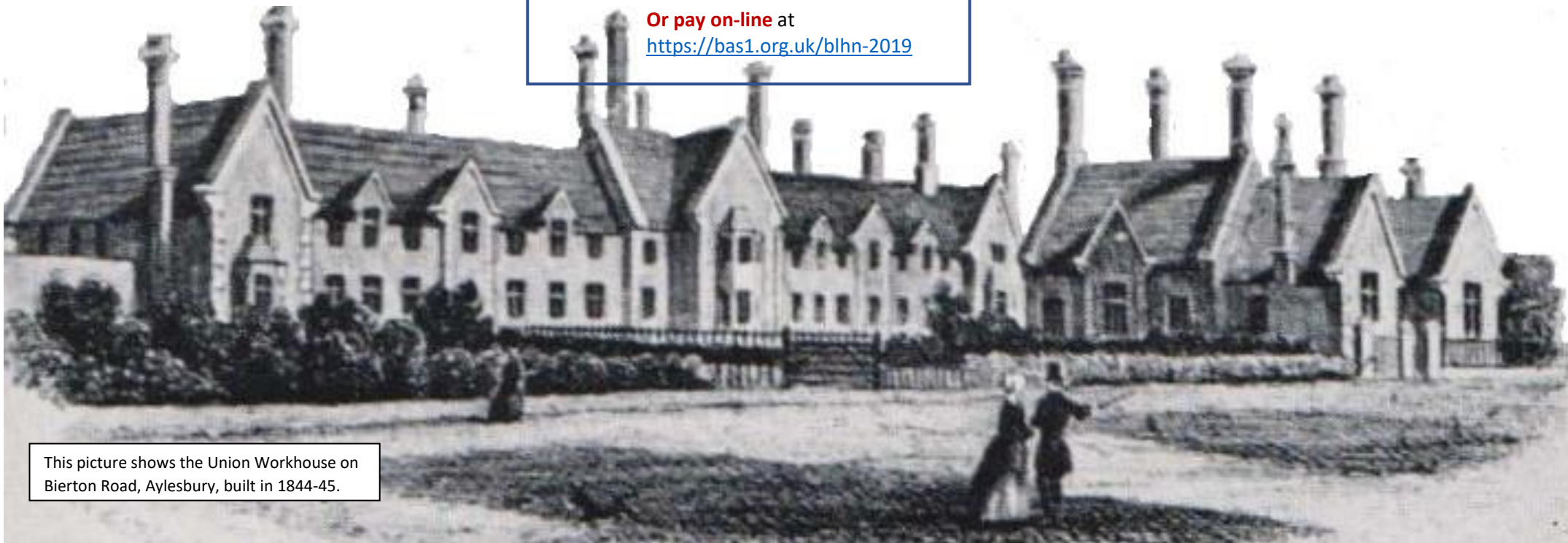
This picture shows the Union Workhouse on Bierton Road, Aylesbury, built in 1844-45.

at The Oculus Conference Centre, Aylesbury