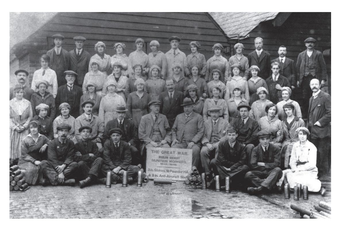
FIGURE 2 Wethered's Munitions Workers c. December 1918.

In October, 'the MD reported that the Company have received instructions from the Ministry of Munitions to change over from 1,200 18 pound HE shells (11/2 net) per week to 2,000 3 inch target smoke shells per week at 8 shillings nett per shell. This was agreed to.' However, this final phase of munitions production was short-lived because, as the Managing Director reported in November, 'in consequence of the Armistice having been signed