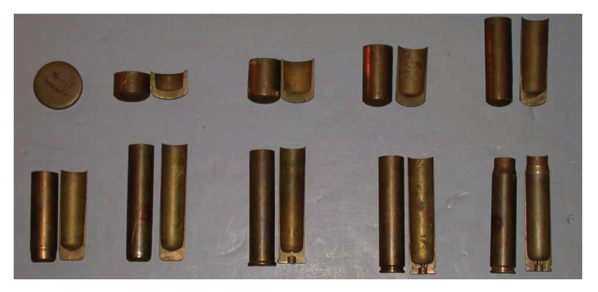
FIGURE 3 Photo of shell cases

The manufacturing of shell cases required the use of special presses and dies to shape the cases. Additionally, to prevent internal stresses cracking in the brass, the heating process of annealing was