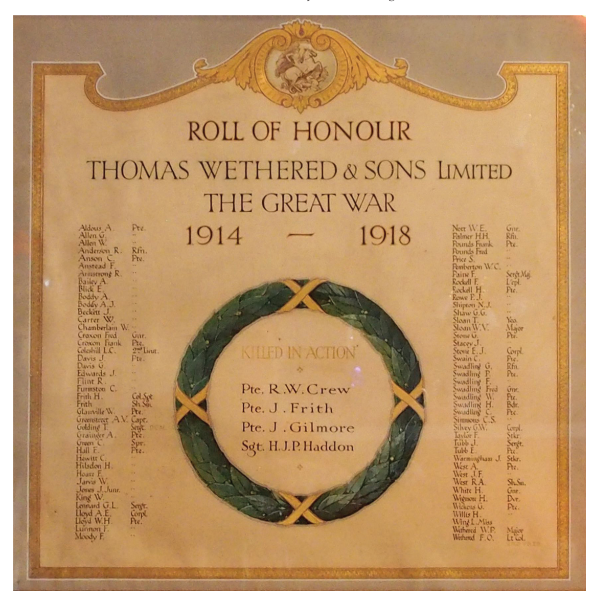
FIGURE 4 Wethered Brewery Roll of Honour.

there was sufficient work for two coopers and that no replacement could be found.<sup>50</sup>